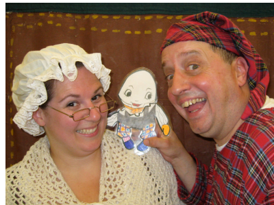
Two Marys, Five Jacks and One Very Big Shoe: a clever retelling of the rhymes of Mother Goose