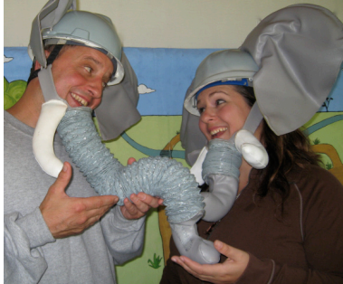
Stubby the Elephant