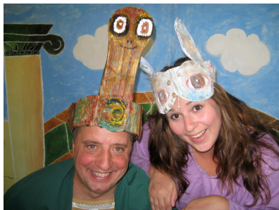
Aesop and the Bully: A Fable for Our Times

These three shows are appropriate for ages 3-5 years. In Stubby the Elephant the crocodile makes a splash in the "great grey-green greasy Limpopo River" that Stubby will not soon forget! Your children get to be many jungle animals. In Little Red Riding Hood the audience, collectively, plays the title role! In The Three Bears your children are Baby Bear! $300 per show for The Three Bears • $400 per show for Stubby the Elephant and Little Red Riding Hood (plus travel)