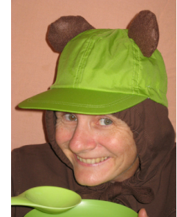
The Three Bears

These three shows are appropriate for ages 3-5 years. In Stubby the Elephant the crocodile makes a splash in the "great grey-green greasy Limpopo River" that Stubby will not soon forget! Your children get to be many jungle animals. In Little Red Riding Hood the audience, collectively, plays the title role! In The Three Bears your children are Baby Bear! $300 per show for The Three Bears • $400 per show for Stubby the Elephant and Little Red Riding Hood (plus travel)