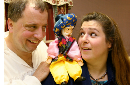
Genies, Lamps, and Dreams: Tales of the Arabian Nights

These three shows are for ages 3-9 years. In Aesop and the Bully , the children help Demetra and Aesop act out fables. In Two Marys, Five Jacks, and One Very Big Shoe , children recite, sing, and finger play nursery rhymes. In Genies, Lamps, and Dreams , children become fish in the sea, birds, frogs, and doors that say "Open Sesame!" $400 per show, plus travel